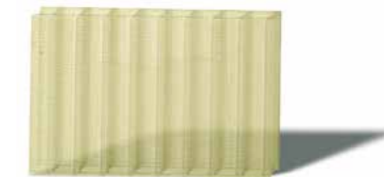
Sample 3: ΔYi = 10: Typical polycarbonate multiwall sheet warranty