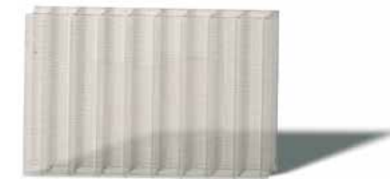
Sample 1: ΔYi = 0

Please consult your local distributor or SABIC's Innovative Plastics Sales Office for more details.