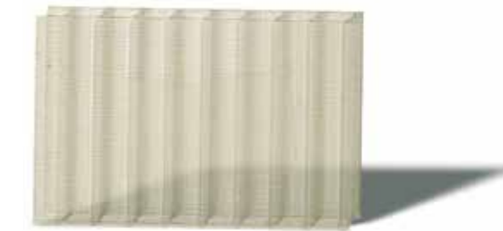
Sample 2: ΔYi = 2: LEXAN THERMOCLEAR sheet warranty