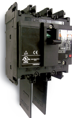
Fuji Electric using NORYL resins for switch gear isolator plates

ULTEM resin spun fibers may address your need for inherent flame resistance; low smoke toxicity; aesthetic. For railway interior fabrics and panels, ULTEM polyetherimide (PEI) resin from SABIC has the high-temperature performance and inherent flame resistance manufacturers need to meet the increasing challenges of stringent flame resistance and low FST (Flame, Smoke and Toxicity) regulations. Plus, with great aesthetic qualities and good dyeability, it's a smart way to achieve both compliance and appearance at the same time. This advanced amorphous polymer allows woven fabrics to be colored using conventional exhaust dyeing techniques, resulting in exceptional colorfastness and high tolerance to UV light. ULTEM resin also offers lightweight advantages along with outstanding mechanical integrity at elevated temperatures, and can be blended with other fibers for an optimal balance of performance and cost.