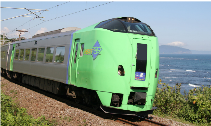
Coated, transparent LEXAN MARGARD Sheet has been chosen by TOHO SHEET & FRAME CO., LTD, a leading Japanese converter, for the double glazing of side windows of The JAPAN RAILWAYS HOKKAIDO.

LEXAN MARGARD™ MRT sheet can be an excellent choice to reduce railcar weight by replacing traditional glass, offering excellent abrasion resistance behavior combined with excellent chemical resistance. Additionally, LEXAN MARGARD MRT sheet can provide reduced weight, high impact strength and forced entry protection, graffiti resistance, excellent flame retardance and UV- and abrasion resistance. It can be an excellent candidate for the compartment partitions, windscreens, interior separation windows and map covers.