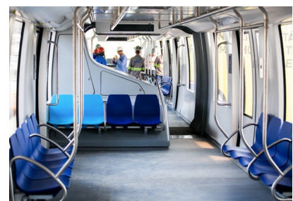
The new seats of Brazil's new Sao Paulo monorail are being manufactured by Monte Meão for Bombardier using NFPA-130 compliant LEXAN FST3403 resin.