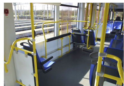
ULTEM R16SG29 (PEI) sheet railway interior cladding

ULTEM R16SG29 sheet is a polyetherimide (PEI) material that features inherent flame retardancy and low smoke emission. It complies with the U.S. FRA norm for interior applications. ULTEM R16SG29 sheet delivers excellent impact resistance and chemical resistance for easy cleaning, anti-graffiti performance and long use of life.