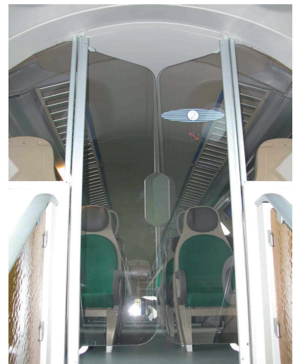
Italian railways compartment separators using LEXAN MARGARD sheet.