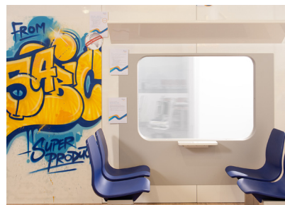
Railway interior using new LEXAN KH6500 sheet

LEXAN H6500 sheet is an opaque, solid, low-gloss PC/ABS blend that delivers high stiffness for railway sidewalls, tables and seating. Its sustainable fire retardance meets the requirements of the Restriction of Hazardous Substances (RoHS) directive and it delivers non-chlorinated and non-brominated product technology. LEXAN H6500 sheet complies with current U.S. FRA standards. The material can be thermoformed at a lower temperature than traditional PC materials. Its molded-in color capability can help avoid the cost and environmental hazards of painting and provides excellent aesthetics.