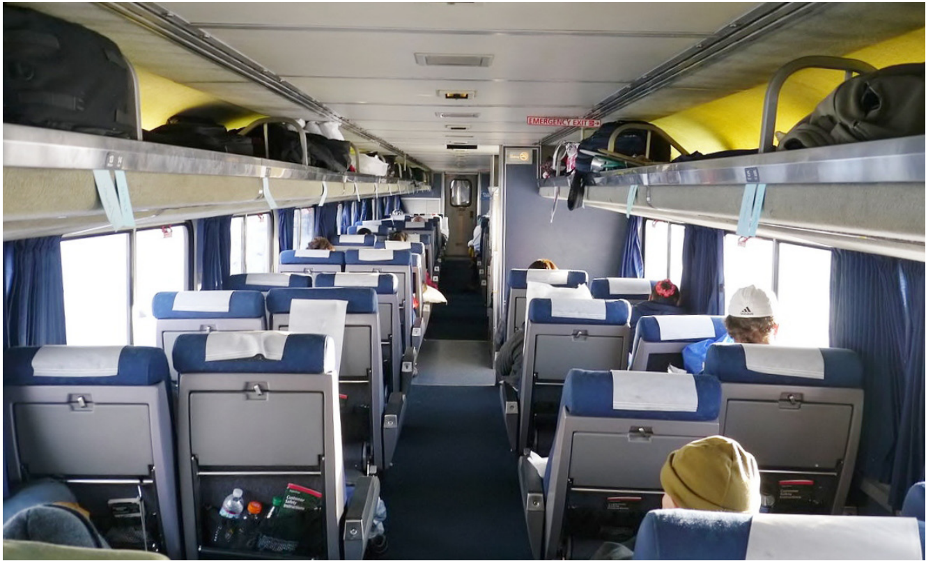
Amtrak uses LEXAN FRA 25C sheet for its passenger train's window glazing.

Both LEXAN FRA 25C sheet (.250") and LEXAN FRA 460 sheet (.460") are monolithic, high impact resistant polycarbonate sheets with a proprietary abrasion resistant surface, providing 70 times the impact resistance of laminated glass with no spalling. These products have been specifically developed for rail glazing applications. LEXAN FRA 460 sheet and dual glazed LEXAN FRA 25C sheet with a .250" air gap meet the UMTA glazing guidelines and the FRA Type I & II ballistic and impact requirements. Both products are UL listed.