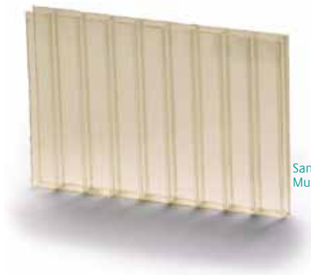
Sample 3 \Delta Y_i = 10 Typical Multiwall PC sheet warranty