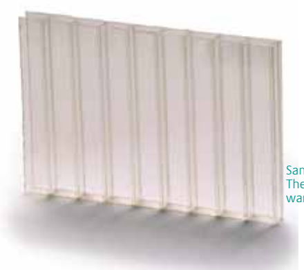
Sample 2 \Delta Y_i = 2 Lexan* Thermoclear* Plus sheet warranty