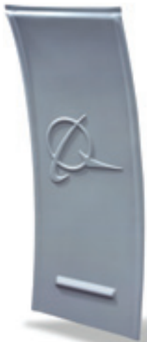
Thermoformed by Texstars Inc., ULTEM 1668A sheet forms the entire cockpit of C17 jetliners. The material was chosen for its flame, smoke and toxicity performance and for its exceptional impact strength.

ULTEM 9085 resin is a new-generation product that goes beyond compliance with better flow, improved impact performance, lower processing temperatures and a wider processing window – all while maintaining its high modulus and heat resistance. For customers, that means key advantages like thinner walls, lower cost and lighter weight. ULTEM 9075 resin is a product with a proven track record in the aircraft industry for use in many cabin interior applications such as passenger service units and window frames. For extruded profiles, ULTEM 9076 resin has lower flow behavior, allowing an improved processing window.