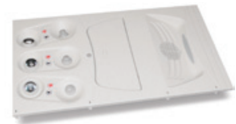
Goodrich Hella Aerospace Lighting System's passenger service unit using ULTEM resin