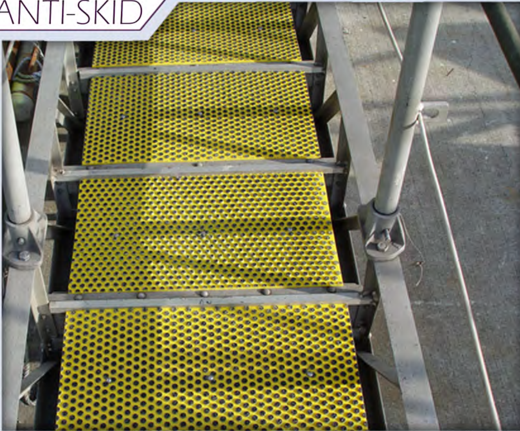
Ultra High Molecular Weight Polyethylene - Braxx®