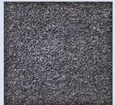
Luns® - Slag