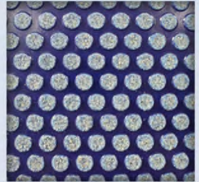
Braxx® - Sand