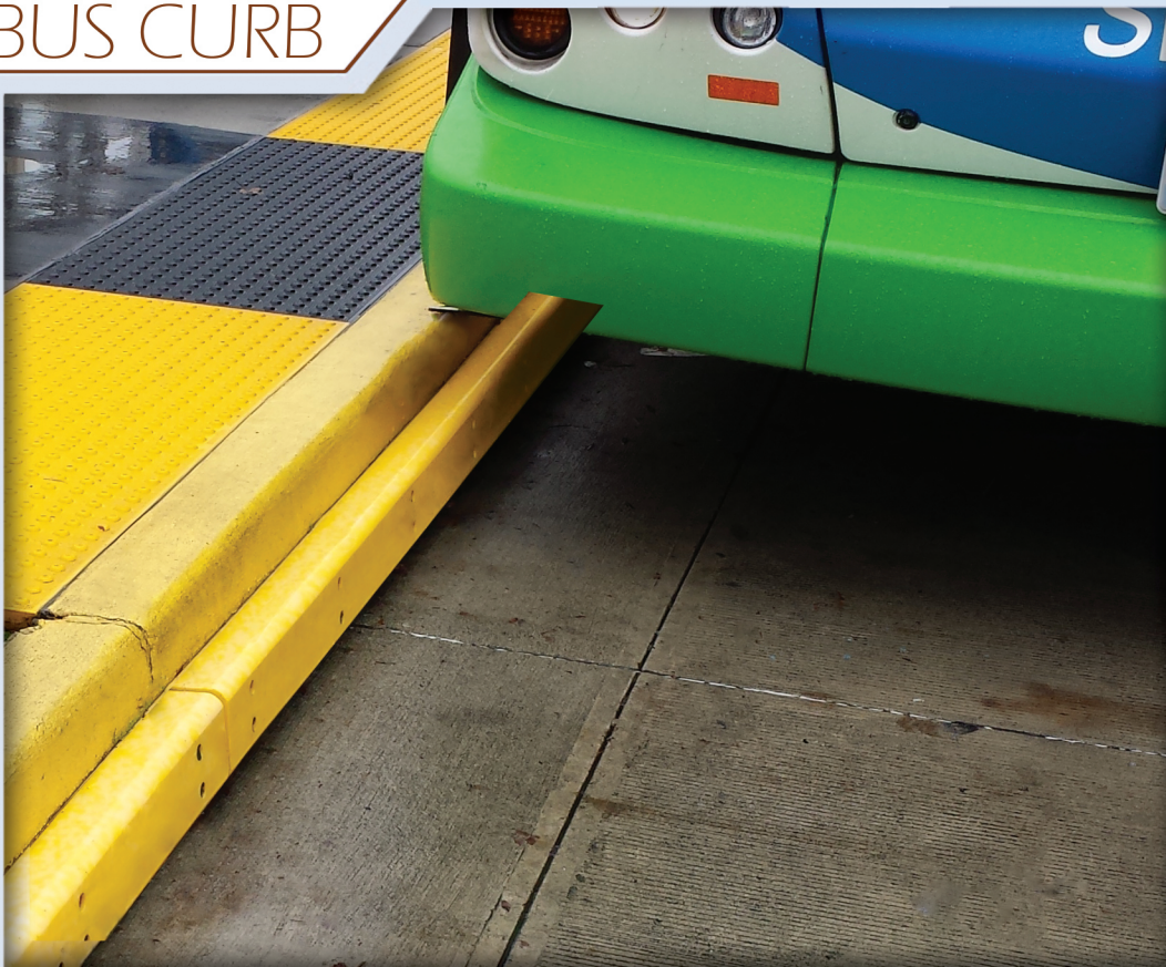
Custom Formulated POLYSLICK® Bus Curb