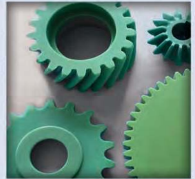
Excellent Wear Resistance